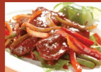
Fillet Steak Cantonese Style