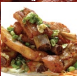
Spicy Barbecued Spare Ribs