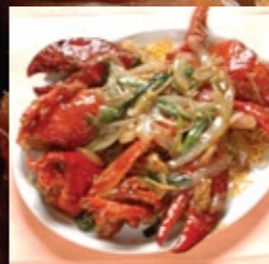
Lobster with Ginger & Spring Onion