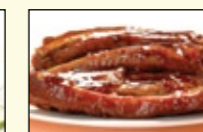
Spare Ribs Peking Sauce