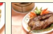
1/4 Crispy Duck (with pancake)