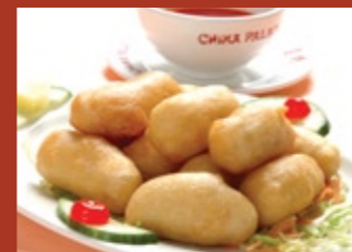
Sweet & Sour Chicken (in batter)