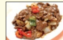
Beef with Black Bean Sauce