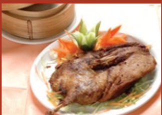
Aromatic Crispy Duck (serve with Pancakes) Half