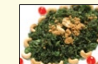
Crispy Green (seaweed)