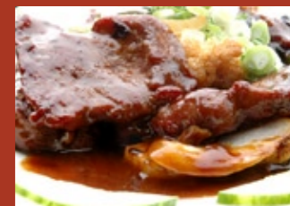
Fillet of Beef Sauted Black Pepper