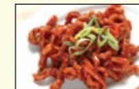
Shredded Beef in Chilli