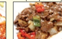
Beef with Black Bean Sauce