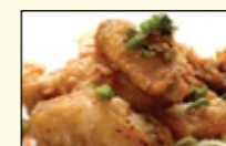
Spicy Chicken Wings