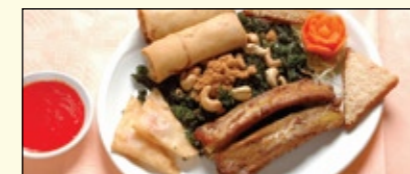
Combination 5 mixed starter