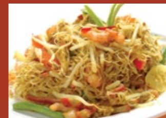
Singapore Spicy Noodles