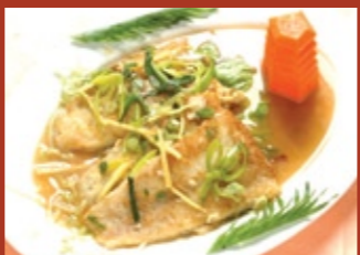
Grilled Sole Peking Style