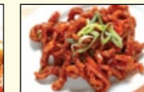
Shredded Beef in Chilli