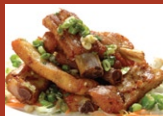
Spicy Barbecued Spare Ribs