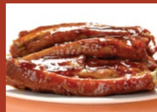
Barbecued Spare Ribs with Peking Sauce